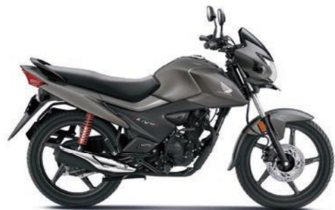
MATT CRUST METALLIC